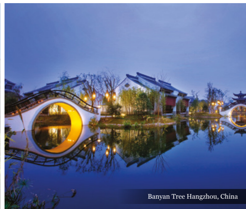
Banyan Tree Hangzhou, China