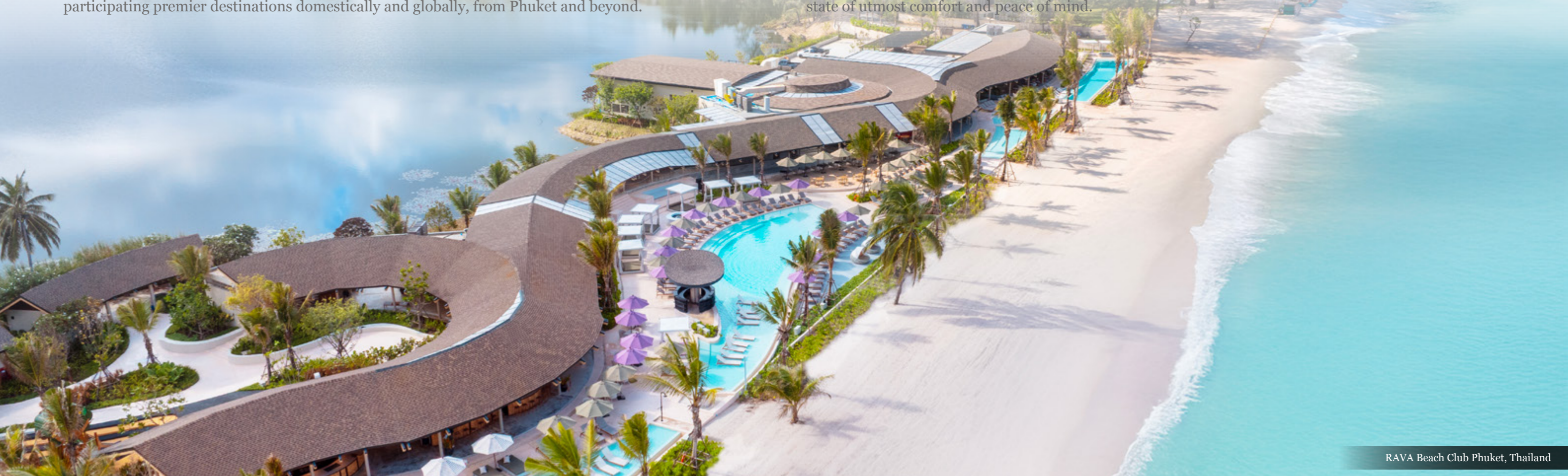
RAVA Beach Club Phuket, Thailand

Beyond an extensive suite of exceptional services and amenities, homeowners will benefit from the professional and hassle-free management of their property as part of Garrya Phuket Hotel's exclusive collection. In addition, the Laguna Advantage programme also offers a range of services to make their life in Phuket more seamless and comfortable. Embrace luxurious beachfront living and enjoy basking in a state of utmost comfort and peace of mind.