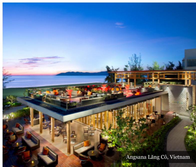
Angsana Lăng Cô, Vietnam