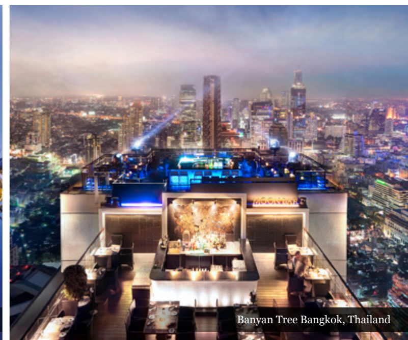
Banyan Tree Bangkok, Thailand